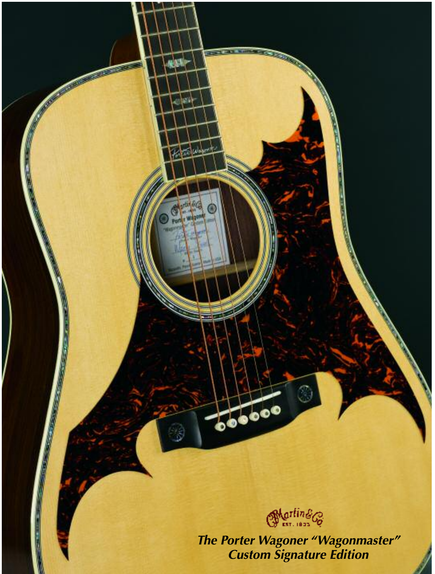
The Porter Wagoner "Wagonmaster" Custom Signature Edition